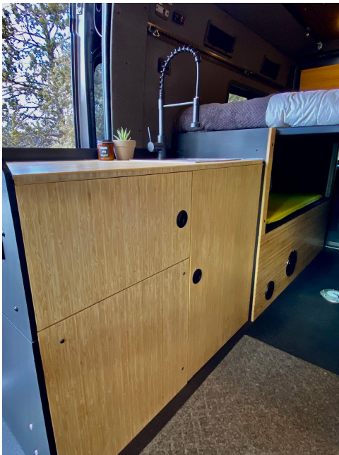
Bamboo Faced Galley