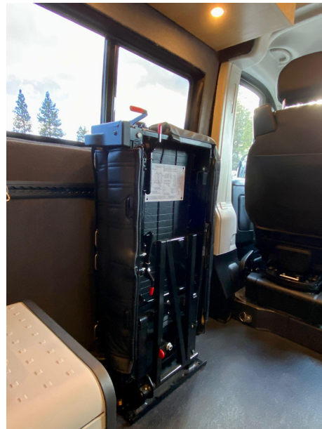
Stow-n-Go Seat - Closed