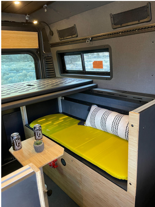
"Day Mode" 2 Person Dinette - View 1