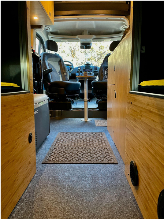
View From Rear (Bamboo Faced Lower)