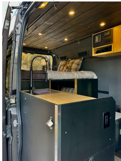
Galley view from slider - bottle opener ;)