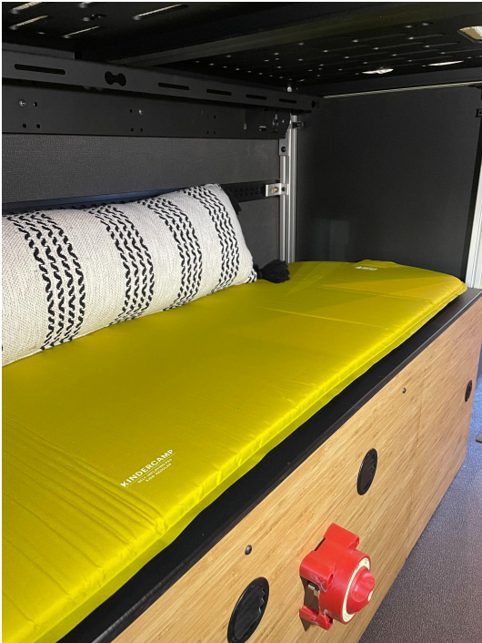
Drivers Side Lower Bunk (64"L X 25"W)