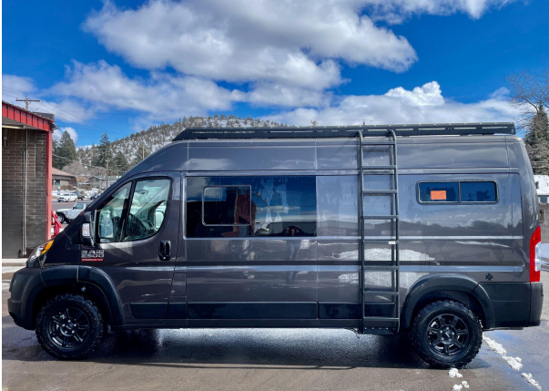
Left Side View (Ladder) & Venting Windows