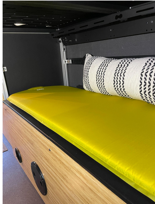
Passenger Side Lower Bunk (64"L X 25"W)