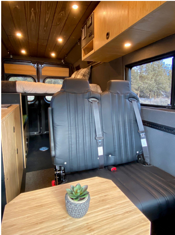
Stow-n-Go Seat - Open