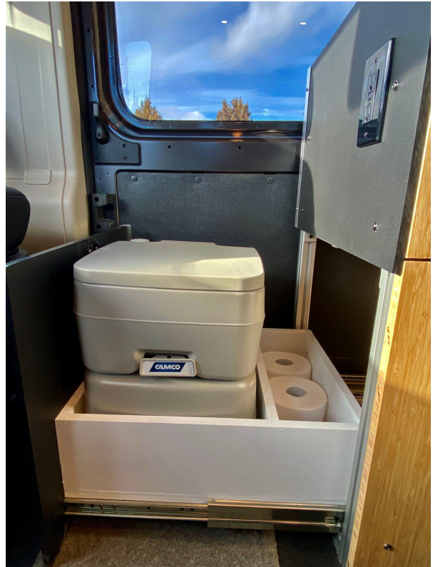
Hidden Toilet Drawer