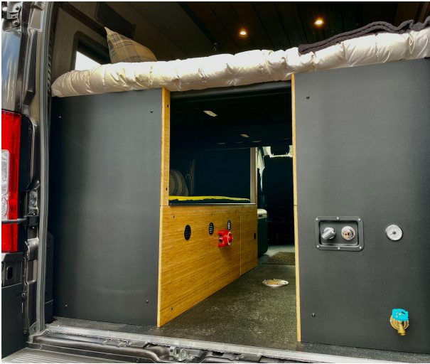
Outdoor Shower/Wash Down