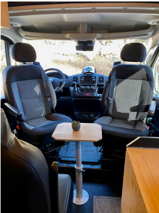
Front Chairs Swiveled