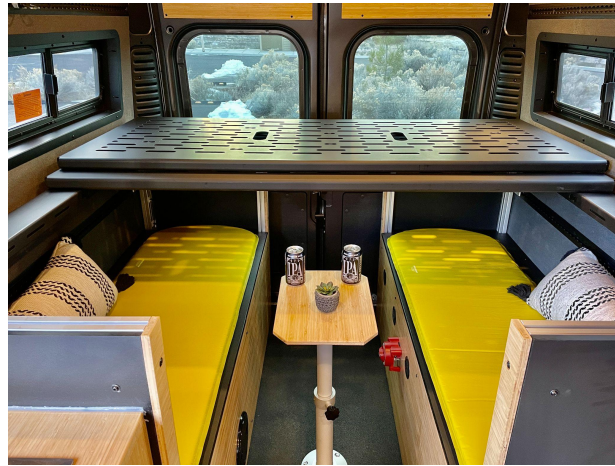
"Day Mode" 2 Person Dinette - View 2