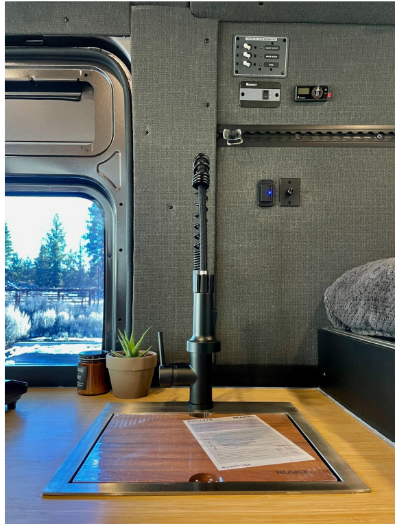
Deep Bar Sink