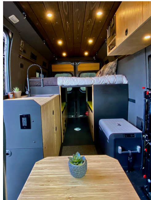
View From Front (Chairs swiveled)