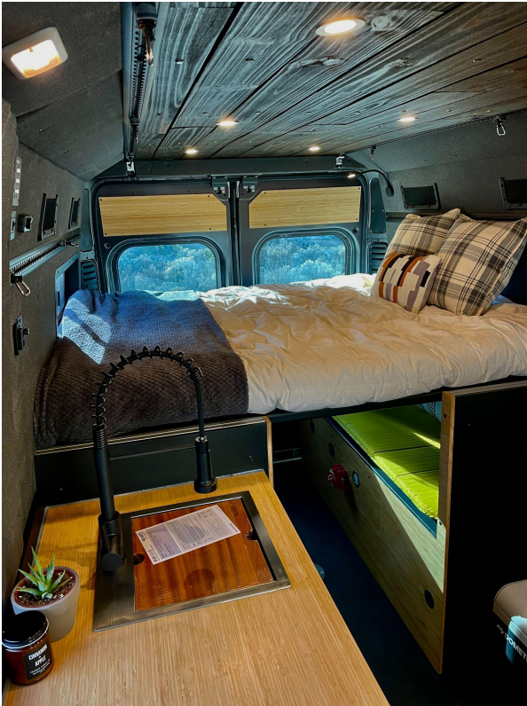
Galley and Upper Bed (RV Queen 72" L X 60" W)