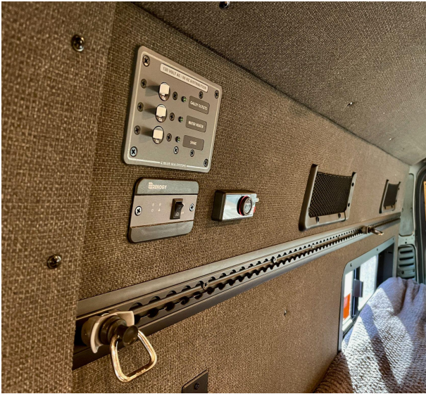
AC Panel & Thermostat